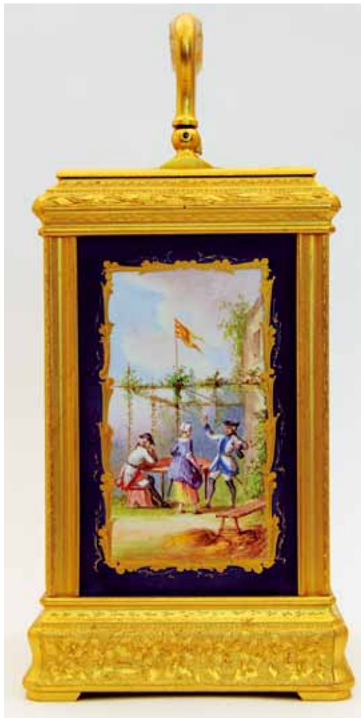
Fig. 9. Caldwell Clock, left panel.