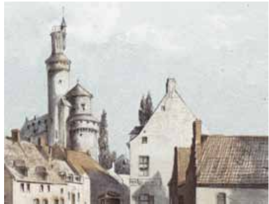
Fig. 17. Antoing: vue intérieure (detail).

French officers celebrating the recovery of French Flanders, gathered beneath pergolas symbolizing France's affinities with Catholic Flanders, surrounded by Flemish flags in the proximity of Antoing, all together lend verisimilitude to the tableau. Other than Fontenoy, French officers had little to celebrate in the mid-eighteenth century, an inglorious military era for a France overshadowed by England's navy supremacy. For a French nineteenth-century porcelain artist looking back, in the manner of genre painters of the day, to the previous century's most celebrated