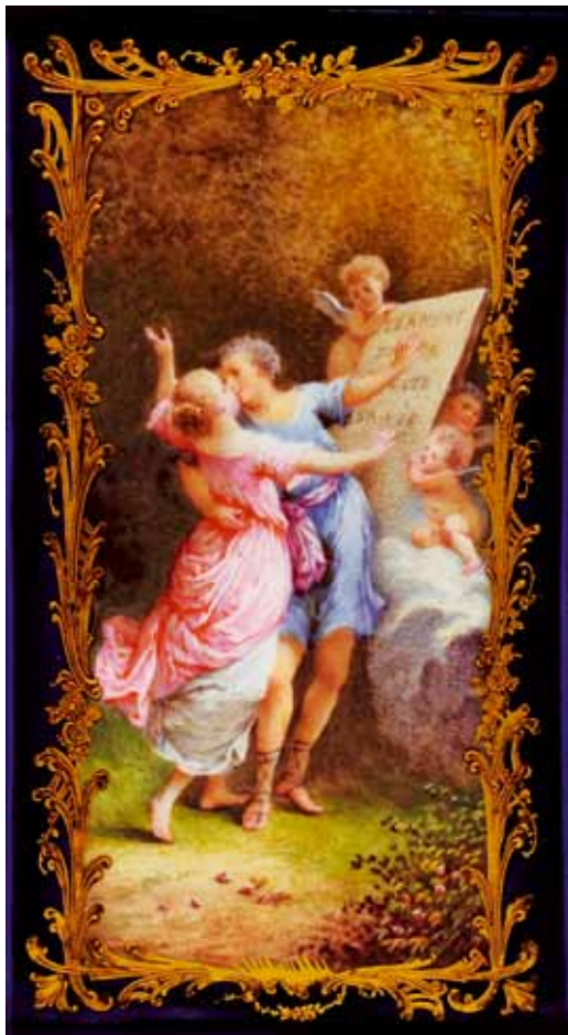
Fig. 6. Neave Clock, The Oath Panel.

lovers in contemporary dress flirting in a garden around a decorative fountain. With this composition, Fragonard returned the allegory to its more classical origins and imbued it with the thrilling rush of those first beguiling moments of love. 14