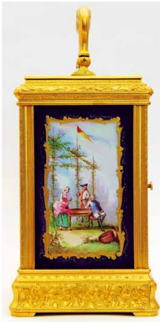
Fig. 10. Caldwell Clock, right panel.

their location. The exact significance of the pergolas, often symbolizing comity or affection, is obscure; the flags are not immediately recognizable. The buildings, particularly the dominant tower, could be real or imagined.