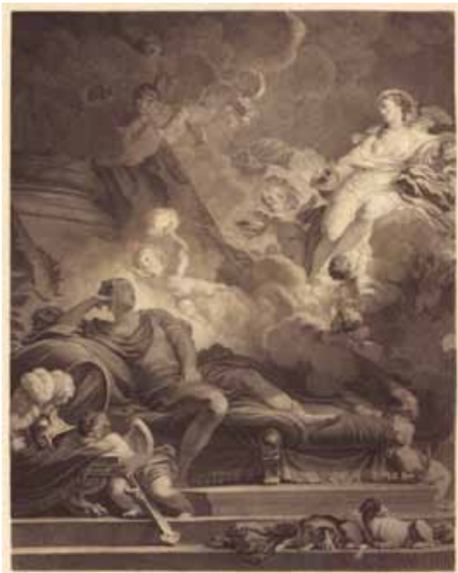
Fig. 3. Le Songe d'Amour ( Love's Dream ), 1785. Nicolas François Regnault (French, 1746-1810) after Jean-Honoré Fragonard. Stipple etching (proof before engraved title). Widener Collection, 1942.9.2119, National Gallery of Art, Washington, D.C. Public Domain. The autograph painting, oil on canvas, The Warrior's Dream of Love , is in the Musée de Louvre, Paris. (R.F. 2149).

On the Neave Clock's dial and panels are faithful replications of three images from a series known as Fragonard's Allegories of Love: The Warrior's Dream of Love , The Fountain of Love , and The Oath of Love . Executed in the late 1770s and early 1780s, the Allegories have been called 'perhaps the most revolutionary artistic achievements of the latter part of Fragonard's career.' 3 Figs. 2 through 7 depict the clock's porcelains and their counterpart Fragonard sources. 4 They represented 'a new Romantic sensibility [... and] are among the earliest and most eloquent expressions of a new vision of romantic love as an all-consuming experience of near-