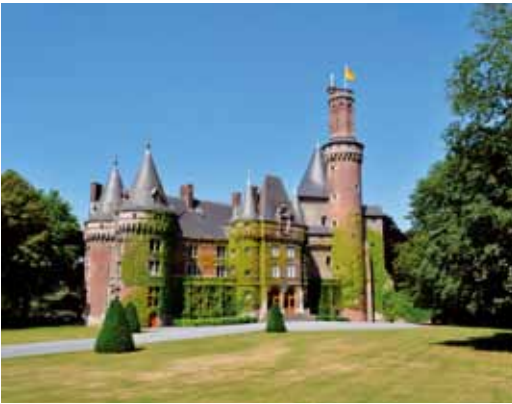
Fig. 13.