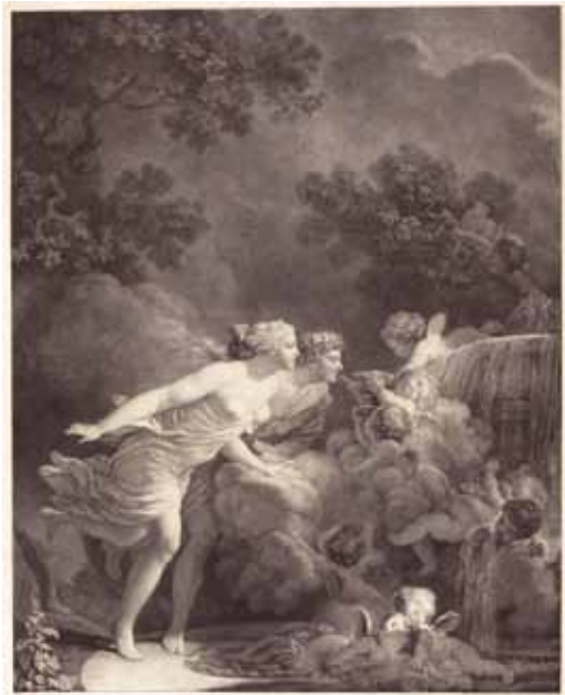
Fig. 5. La Fontaine d'Amour ( The Fountain of Love ). Nicolas François Regnault, after Fragonard, The Fountain of Love , after 1785. Stipple etching. The Getty Research Institute, Los Angeles (2000.PR.73). Two autograph versions, both oil on canvas, c. 1785, are in The Wallace Collection, London, (P394), and the J. Paul Getty Museum, Los Angeles. (99.PA.30).

The lovers approach a fountain. Their romantic fervour is less dramatically portrayed on the panel than on the source image, where their bodies are almost floating as they thrust forward. The porcelain's more upright figures, dictated by the narrow panel, nonetheless manage to convey strong emotion. The source engraving was executed in 1786 (Fig. 5) In the catalogue of a 2015–16 Fragonard exhibition at the Grand Palais in Paris, a curator described The Fountain of Love as 'without any doubt the most poetic and today the most celebrated of the allegories executed by Fragonard.' 13 It was one of only