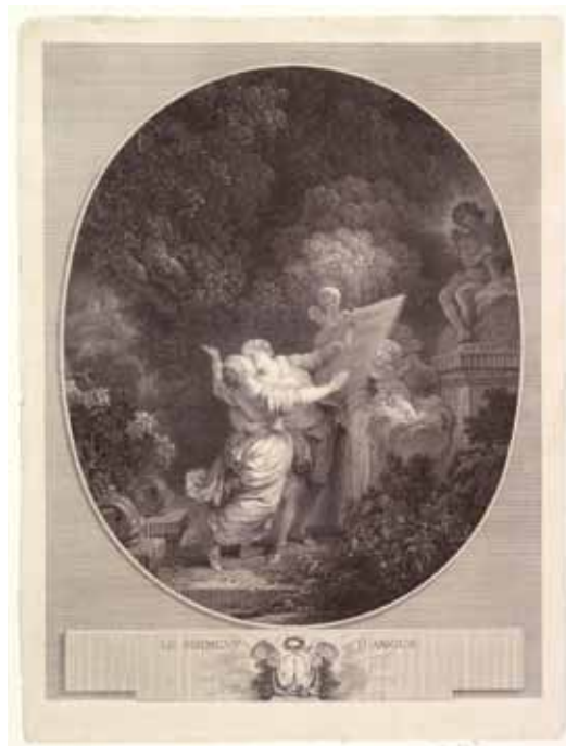
Fig. 7. Le Serment d'Amour (The Oath of Love) . 1786. Engraved by Jean Mathieu, after Jean-Honoré Fragonard, etching second state, The Metropolitan Museum of Art, New York, Accession Number: 41.140.9. Public Domain. A hand-coloured version is found in the collection at the UCLA Grunwald Center for the Graphic Arts, Hammer Museum. Los Angeles.