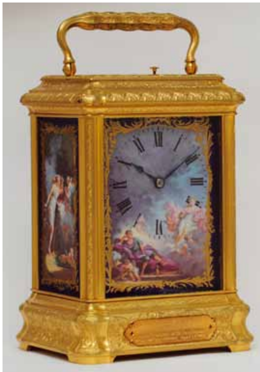
Fig. 1. Drocourt Neave Clock. c. 1885-92. 25 (handle up) x 14 cm. Fully engraved giant gorge case, porcelain dial and panels. Oversize platform escapement. Eight-day duration. Strike and repeat on a gong. Private collection.