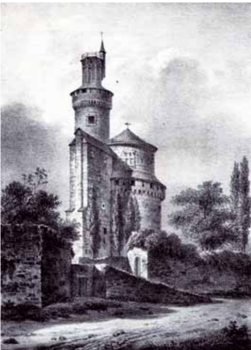
Fig. 14. Tour d'Antoing , prior to Viollet-le-Duc restoration. Image provided by the Ghent University Library.

what is today one of Belgium's most historic castles, located in Antoing. Château d'Antoing was restored in the late nineteenth century by the French architect Eugène Viollet-le-Duc, whose controversial historical fantasies created towers topped by steeply conical roofs similar to those found on this château as well as in his restorations of the spectacular fortified town of Carcassonne and the Château de Montaigne in southwest France.