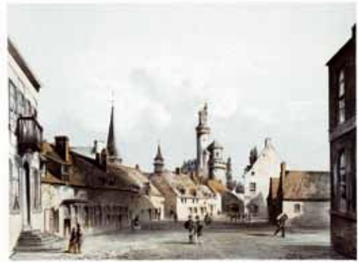
Fig. 15. Antoing: vue intérieure de la ville , prior to Viollet-le-Duc restoration.

what is today one of Belgium's most historic castles, located in Antoing. Château d'Antoing was restored in the late nineteenth century by the French architect Eugène Viollet-le-Duc, whose controversial historical fantasies created towers topped by steeply conical roofs similar to those found on this château as well as in his restorations of the spectacular fortified town of Carcassonne and the Château de Montaigne in southwest France.