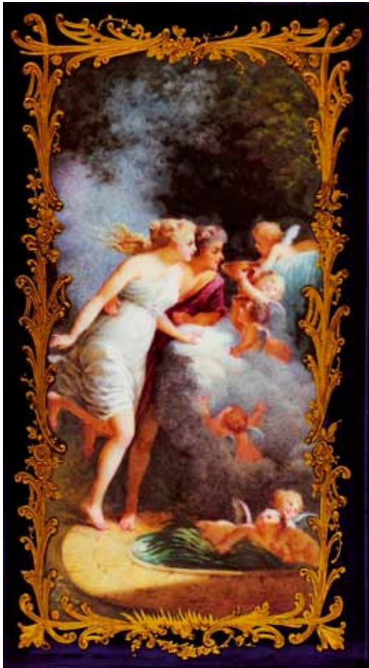
Fig. 4. Neave Clock, The Fountain Panel.