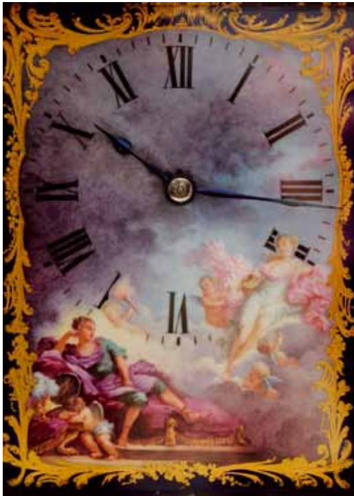
Fig. 2. Neave Clock, The Warrior Dial.

On the Neave Clock's dial and panels are faithful replications of three images from a series known as Fragonard's Allegories of Love: The Warrior's Dream of Love , The Fountain of Love , and The Oath of Love . Executed in the late 1770s and early 1780s, the Allegories have been called 'perhaps the most revolutionary artistic achievements of the latter part of Fragonard's career.' 3 Figs. 2 through 7 depict the clock's porcelains and their counterpart Fragonard sources. 4 They represented 'a new Romantic sensibility [... and] are among the earliest and most eloquent expressions of a new vision of romantic love as an all-consuming experience of near-