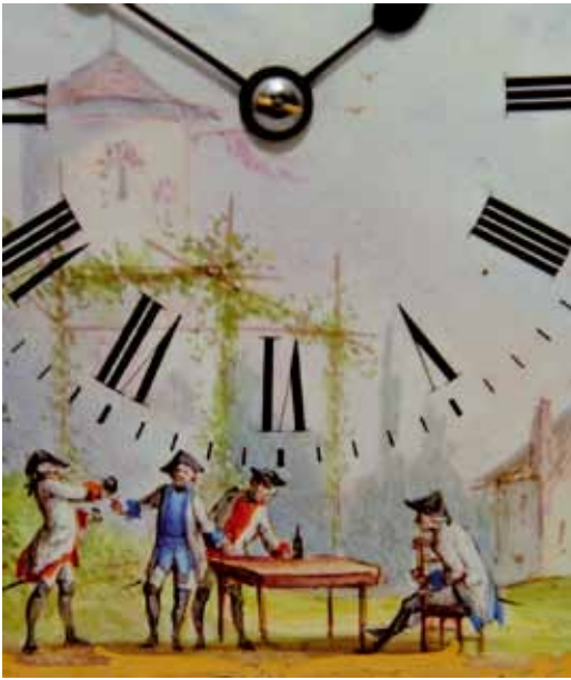
Fig. 16. Caldwell Clock dial (detail).

the main door corresponds closely to the two windows on the tower of the Caldwell Clock. On some images of the monument printed in nineteenth-century books and on postcards, Château d'Antoing is visible along with a distant steeple—almost certainly the church steeple in Fontenoy appearing on the Fontenoy Vase. 19 The Bruyelles ruins appeared in nineteenth century engravings, guidebooks, military histories, and French postcards, all showing oval and reticulated stonework much like the fenestration on the Caldwell Clock tower. Engravings of the pre-restoration Château d'Antoing also show chateau windows with similar surrounds.