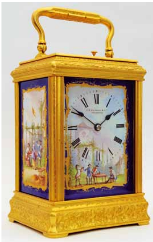
Fig. 8. Drocourt Caldwell Clock. c. 1875-80. 18.5 (handle up) x 10 cm. Fully engraved gorge case, porcelain dial and panels. Eight-day duration. Strike and repeat on a gong. Private collection.

Fountain Panel, both the male and the female wear antique costume and are barefooted. Yet the female on the Oath Panel is painted with bare feet, while retaining her contemporary dress with only minor modifications to its hem line and drapery. Thus she has been given a partially antique look while the male is given a completely antique appearance through costume and Roman sandals. A partially antique outcome, though it conforms the male footwear on the Oath Panel and the Warrior Dial, complicates choices for the female who logically should have been given completely antique costume too. The reason for this purposeful alteration is perplexing, but it provides a rare opportunity to observe such intentionality on the part of a carriage clock artist who was surely no mere copyist.