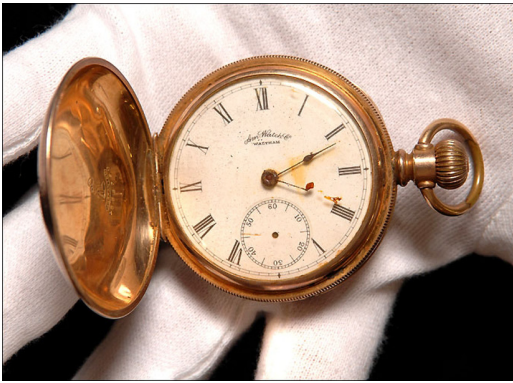
Fig. 8. The watch belonging to Carl Oscar Vilhelm Gustafsson Asplund, third class passenger, indicated around 2.19. The watch was auctioned by Henry Aldridge & Son, Devizes in April 2008.