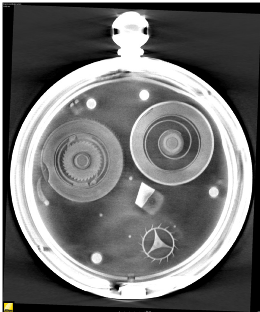
Fig. 5. Showing the relative positions of the fusee hollow and the spring barrel.