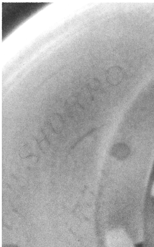
Fig. 4. Through manipulation of the images the signature on the barrel bar became decipherable as SHORRO...

The scans revealed that the watch had a temperature compensated balance and decorative foliate engraving on the balance cock enclosed by a gilt brass cap (Fig. 3). From the 3-D model we found the movement to be in reasonably sound condition. Unsurprisingly, the more delicate steel components such as the balance spring had completely disintegrated but the pinions and arbors survived intact and the scans show